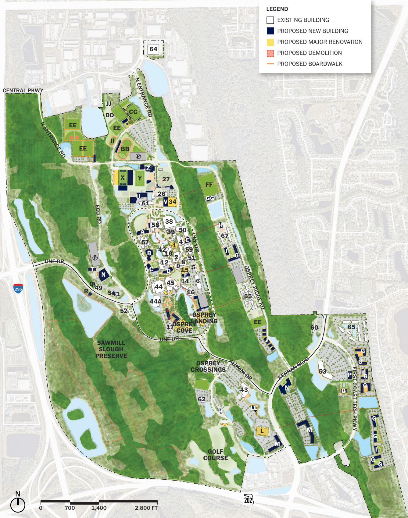
FIGURE 1.1: PROPOSED CAMPUS PLAN