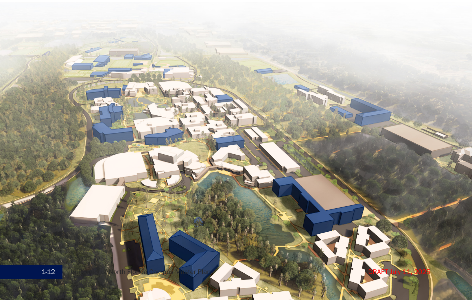
Bird's eye view of proposed campus improvements, looking north

A number of infrastructure improvements will be needed to make sure that existing and future buildings are adequately served.