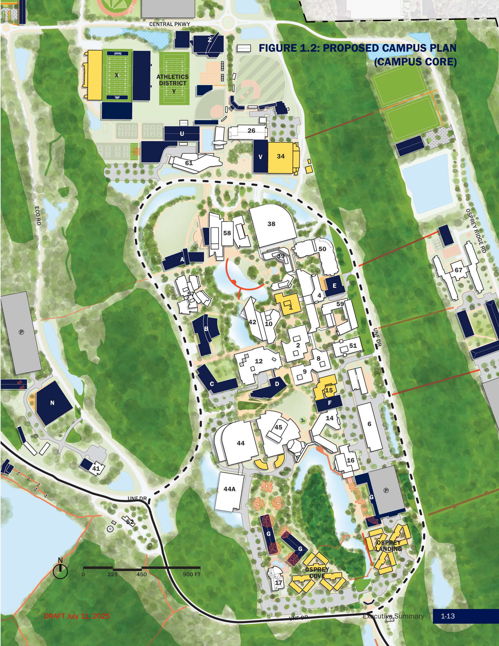
FIGURE 1.2: PROPOSED CAMPUS PLAN (CAMPUS CORE)